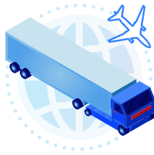
freight forwarders 1