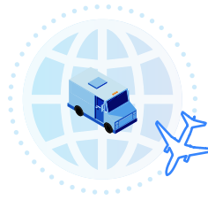
express courier services